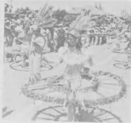
Sun Rays Of Outer Space